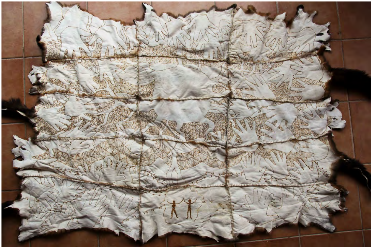
(Sections of the Children's Cloak)