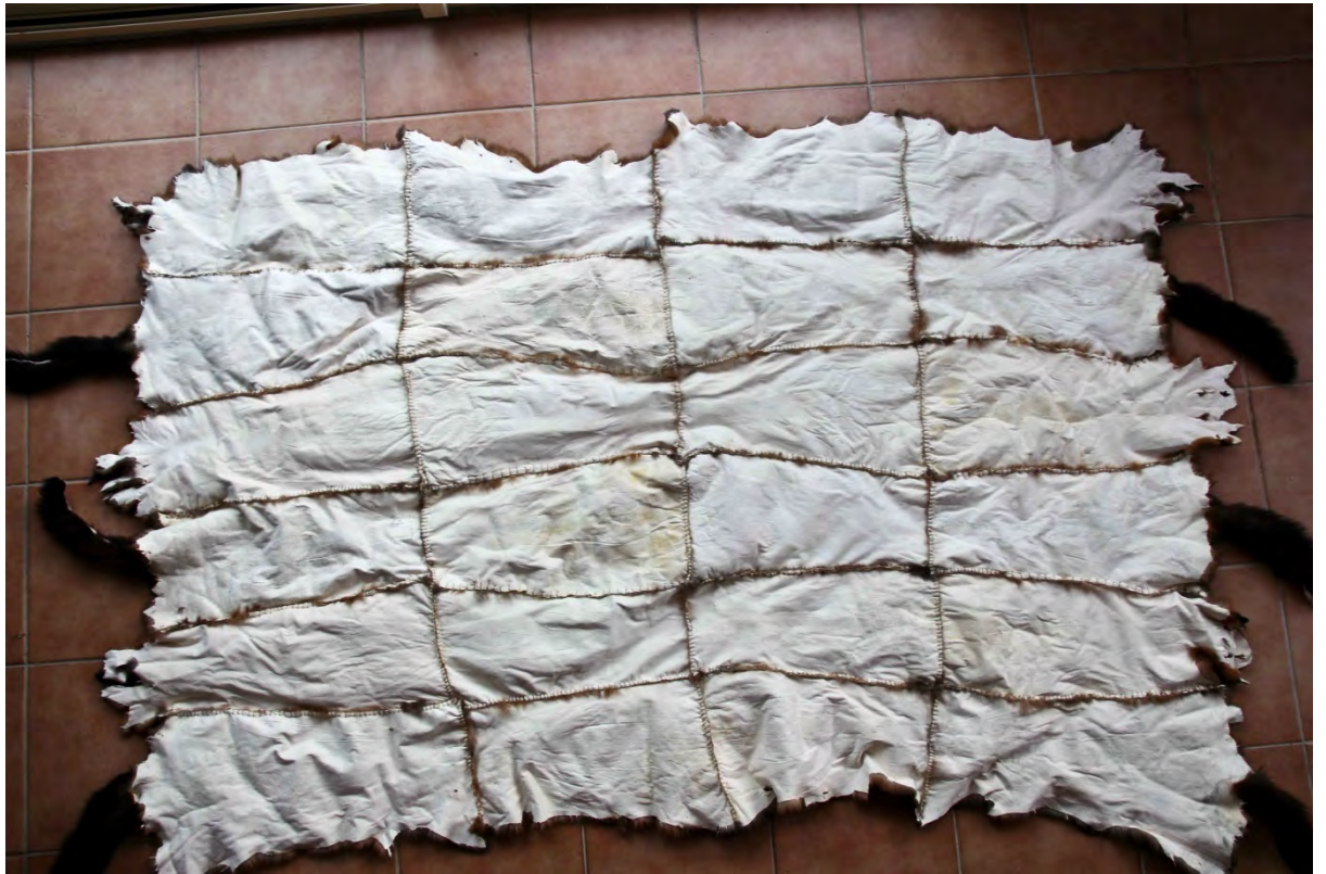
(full view of the Medium sized adult cloak)

Made from 24 Possum skin pelts, The Medium sized adult cloak had been developed to cater for Community members to use but may benefit from the smaller of the two adult sized cloaks. This cloak has no designs painted or burnt onto the cloak as of the 14/05/2015. This could be something for future community events to focus on.