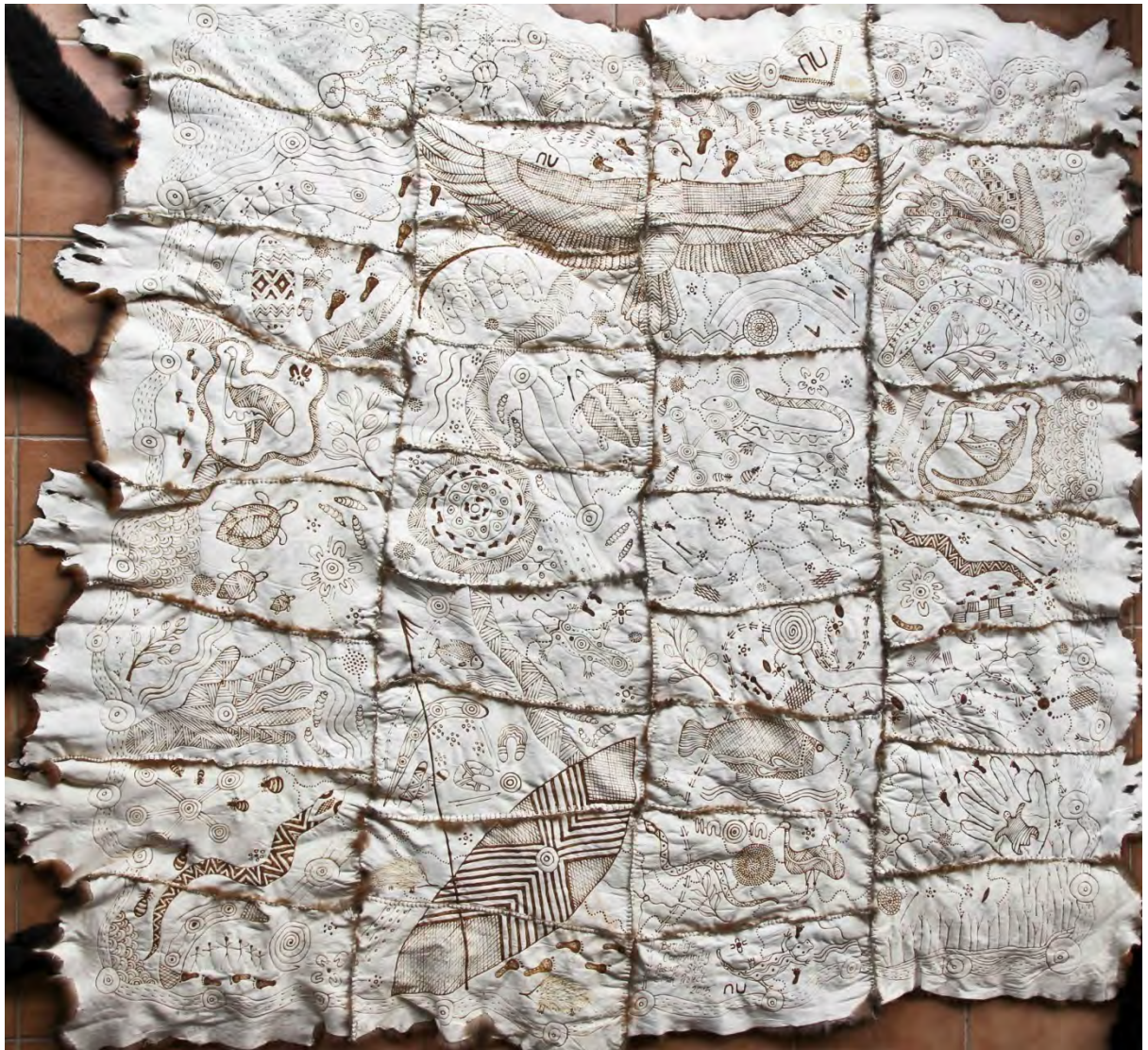
(View of the completed larger sized adult possum skin cloak)