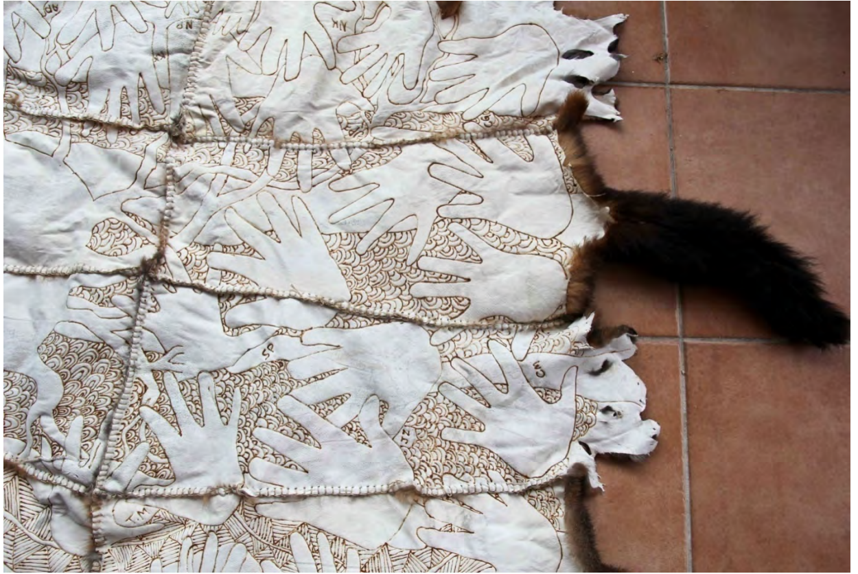
(Sections of the Children's Cloak)