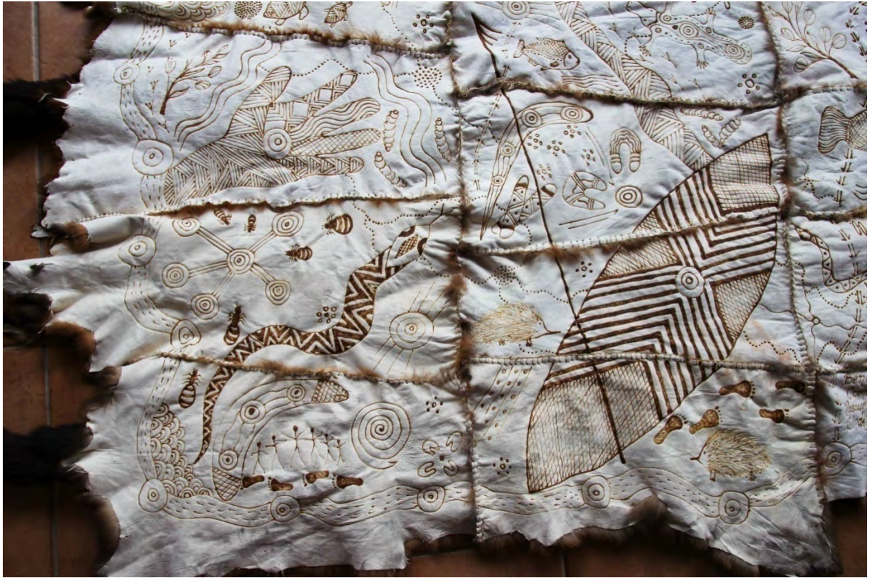
(Sections of the larger sized adult cloak)