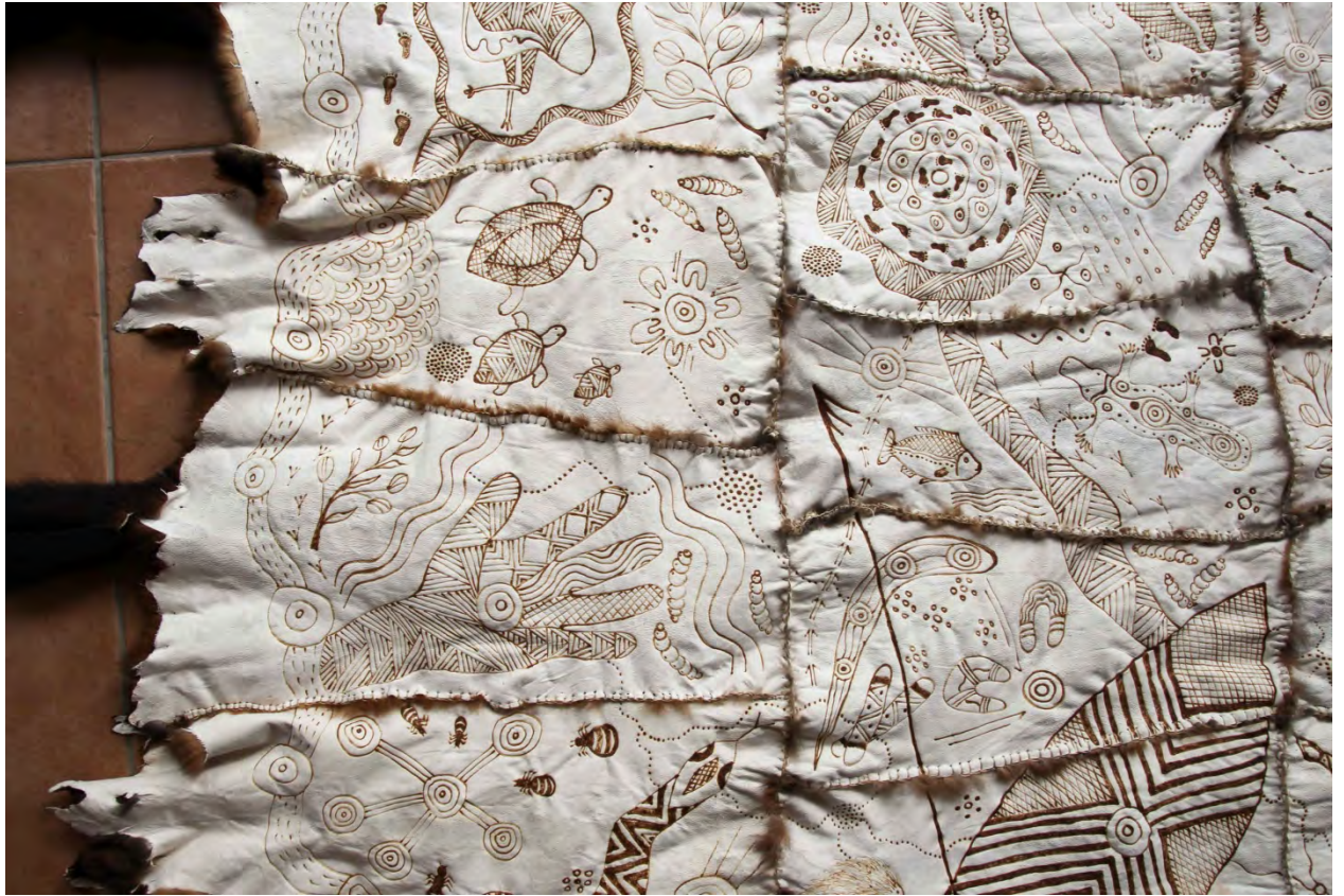
(Sections of the larger sized adult cloak)