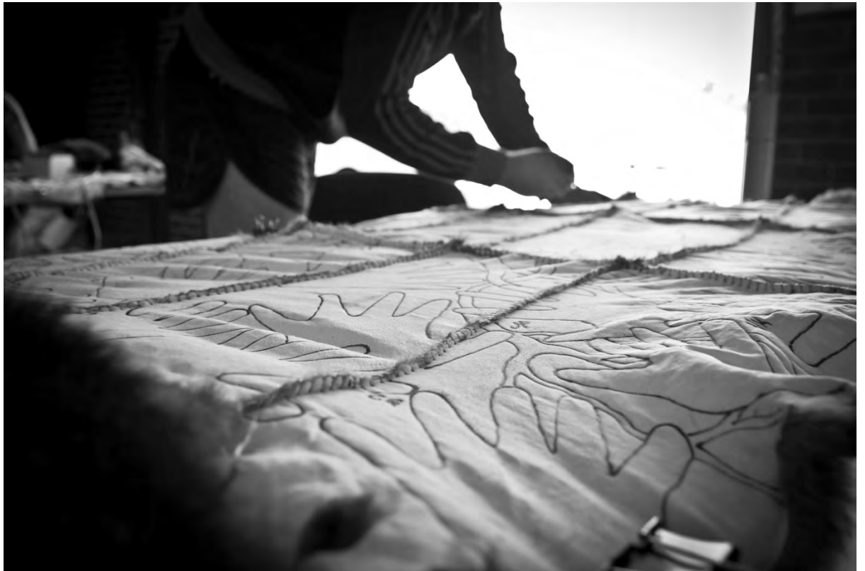
(Matthew working on the Children's Cloak and Design)

However, due to the successful involvement of well over 50 community members attending over the course of the project, we were able to complete the stitching of the entire larger adult cloak within the first day and had nearly completed stitching together the second medium sized adult cloak. The facilitators then decided to go ahead and complete all three cloaks.