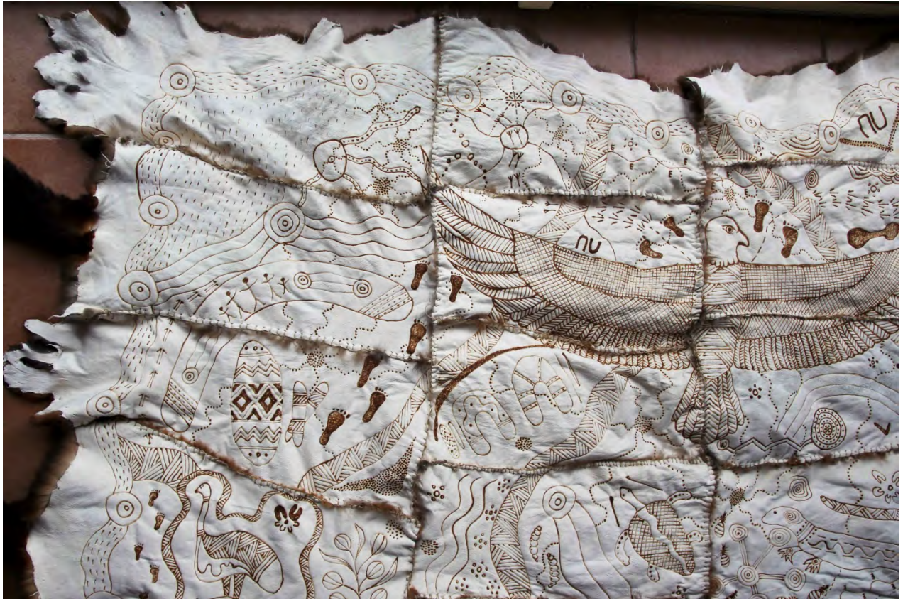
(Sections of the larger sized adult cloak)