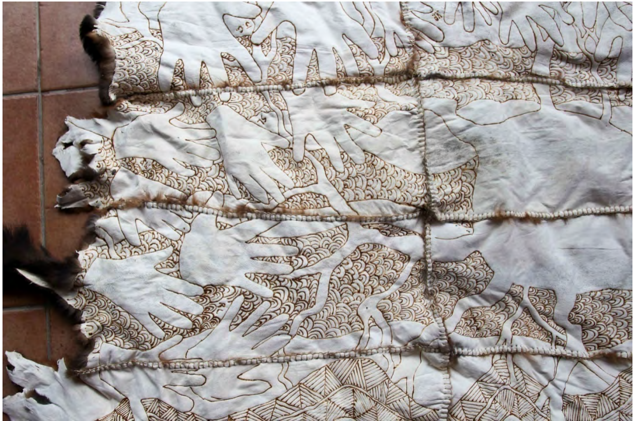
(Sections of the Children's Cloak)