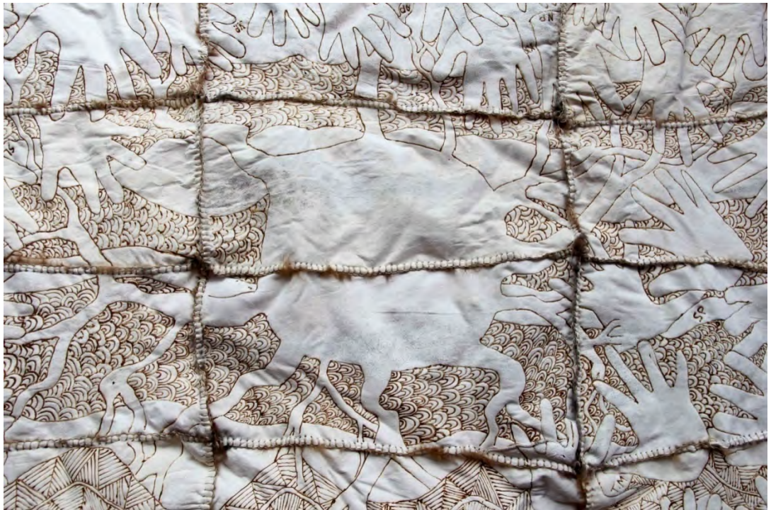
(view of the completed children's cloak)

The children's cloak was made from 15 possum pelts arranged 3 across and 5 down. The featuring design was traced over the cloak lightly from a picture drawn on a piece of paper, and added to over the process. It is as much an image of the spiritual and physical coming together in a heightened state, and where an Adam and Eve-like couple are standing together and raising their hands. Before them the light of the Great Spirit streams through the sky like the sun, a river of life, and connecting the countryside with the people. Surrounding the couple are the hands of all the children who participated in the workshops. This was done by getting the children to sketch the outlines of their hands on a piece of paper which was then cut out and traced lightly onto the cloak.